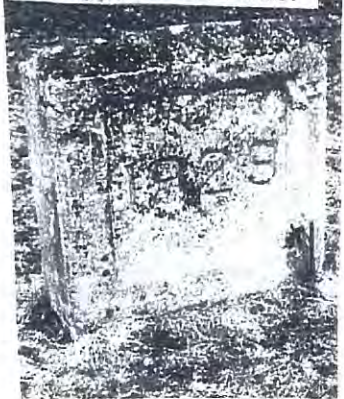
1929 Mad Brook Bridge Stone Marker